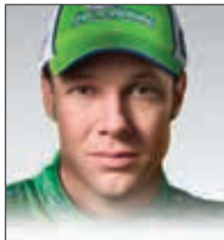
MATT KENSETH, Daytona 500 champion (2009)

With the price of gold hitting all time highs, now is the time to cash-in. Take a look in the bottom of your jewelry box to find those single earrings, broken and dented chains, or the class ring you haven't worn in years. Then, visit us to see just how much your old gold is worth!