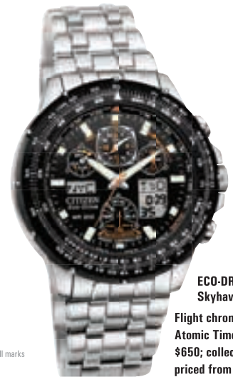
ECO-DRIVE Skyhawk A-T Flight chronograph. Atomic Timekeeping. $650; collection priced from $625.

Use of Matt Kenseth, race car, uniform, and all marks authorized by Roush Fenway Racing, LLC.